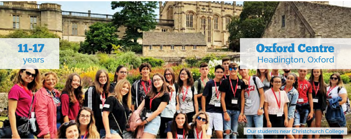
Our students near Christchurch College

Our Oxford centre offers students the opportunity to learn English and explore one of the most prestigious university cities in the world. Our centre is located in Headington, just 10 minutes by bus from the centre of Oxford. Our campus offers a safe and relaxed environment with a brand new accommodation building. Our teaching site is located in Cheney School, which is a traditional English secondary school and sixth form established in 1797.